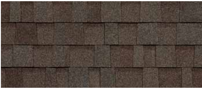
Teak† Not Available in Service Area 1 (see map).