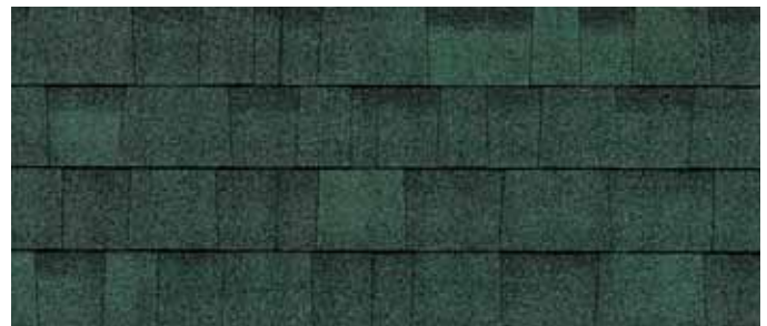
Chateau Green† Not Available in Service Area 1 (see map).